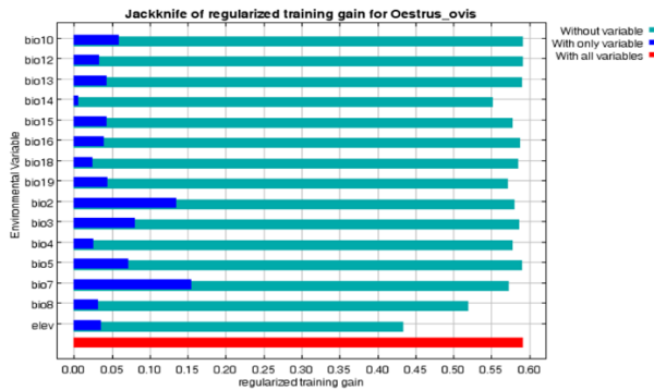
Figure 2: Jackknife analysis for individual environmental variable importance (blue bars) relative to all environmental variables (red bar) for the MaxEnt model. Values shown are averages over 10 replicate runs.