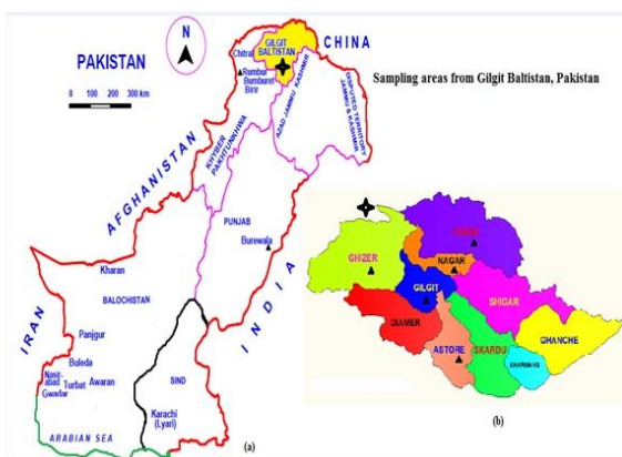
Figure 1: Map of Pakistan showing major ethnic groups and sampling area.