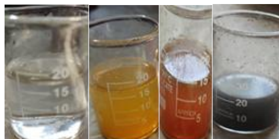
Figure 2: Stages of formation of nanoparticles with oil extract by changing colors.

It was made using an aqueous solution of silver nitrate with the oil extract of Chestnut fruit as reducing, covering and stabilizing agents for the nanoparticles at a temperature of 60°C. The initial diagnosis was done by observing changes in the color of the particles through the appearance of several colors at different times referring to silver nitrate solution from colorless to the colors shown in the figure (2).