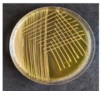
Figure 3: S. aureus isolates from raw milk on mannitol salt agar (MSA) shows golden-yellow pigment colonies of mannitol fermentation

Findings from this study show that 100 samples (89.2%) of the 112 samples of raw milk collected from dairy farms in 2 districts (Pasuruan and Lumajang) of East Java, Indonesia were positive for S. aureus . In Dairy farms from Lumajang, 60 samples were collected and 52 samples (86.6%) were positive for S. aureus and from Pasuruan 52 samples were taken and 48 samples (92,3%) were positive for S. aureus .