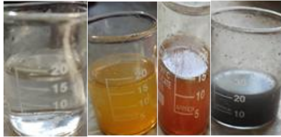
Figure 2. Stages of formation of nanoparticles with oil extract by changing colors.

It was made using an aqueous solution of silver nitrate with the oil extract of Chestnut fruit as reducing, covering and stabilizing agents for the nanoparticles at a temperature of 60°C. The initial diagnosis was done by observing changes in the color of the particles through the appearance of several colors at different times referring to silver nitrate solution from colorless to the colors shown in the figure (2).